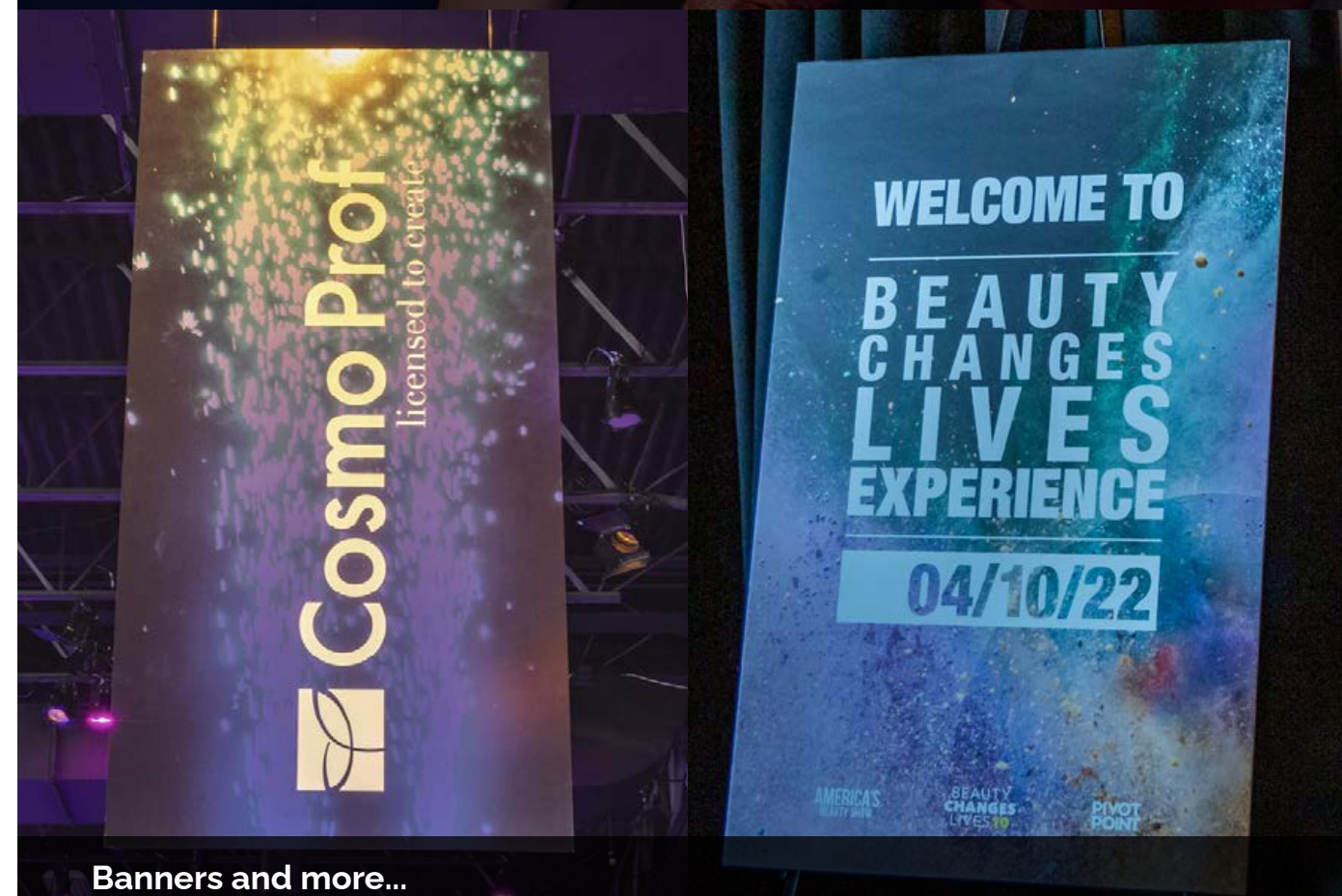
Banners and more...